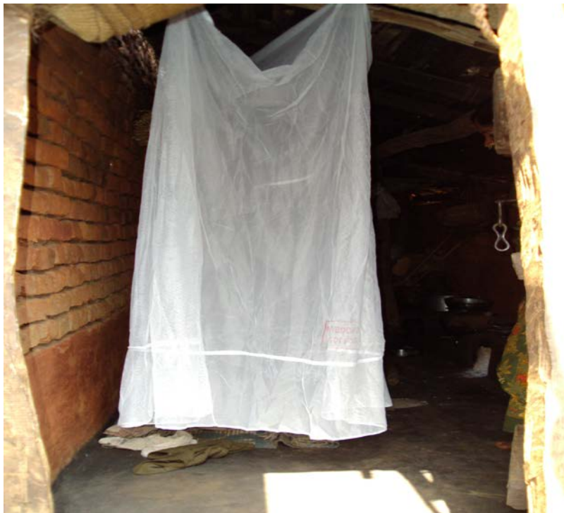
Mosquito nets tied by beneficiaries with ground clearance