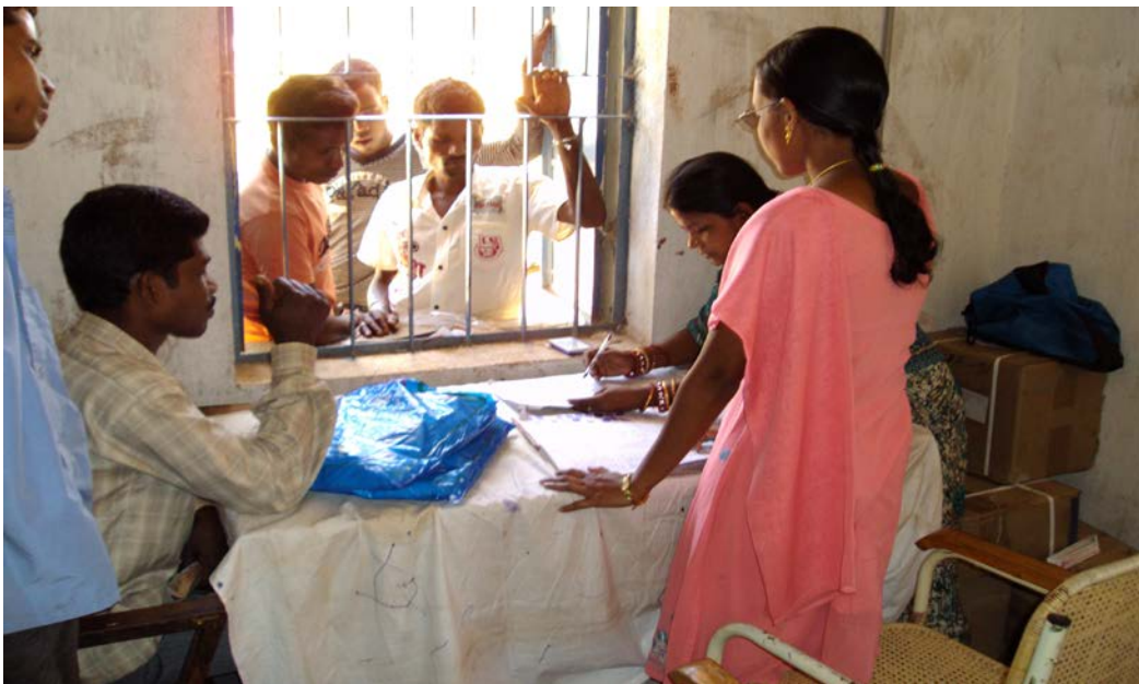
Barrier between the service providers and the beneficiaries (LLIN Distribution going on at PHC (New) Sunger