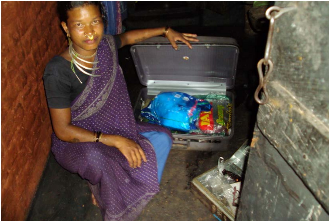
Risking life keeping mosquito nets secured (LLIN kept well locked in boxes without using even after 15 days by a pregnant women)